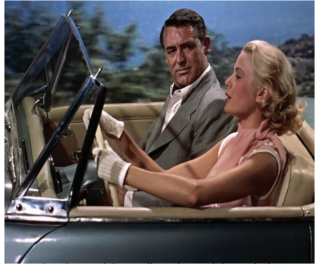
Cary Grant and Grace Kelly on the French Riviera highway

The French Riviera...two luminous stars (Grace Kelly and Gary Grant)...and the Master of Suspense, Alfred Hitchcock, behind the camera. They all add up to one romantic, dazzling screen thriller. Grant plays John Robie, a retired jewel thief once known as "The Cat," who catches the eye of Frances Stevens (Kelly), a pampered, vacationing heiress. But when a new rash of gem thefts occurs amongst the luxury hotels of the spectacular French playground, it appears that "The Cat" is on the prowl once again. Is Robie truly reformed? Or is he deviously using Frances to gain access to the tempting collection of fabulous jewelry belonging to her mother (Jessie Royce Landis). Romantic sparks fly as the suspense builds in this glittering Hitchcock classic that nabbed an Oscar® for Best Cinematography.